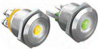
MPI001- front panel seal to IP66