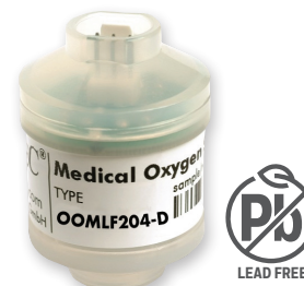
Lead-Free Oxygen Sensor: OOMLF204-D

The EnviteC sensor family is part of the extensive line of Honeywell gas sensors. To learn more about the product, or the many other gas sensors in this series, click here.