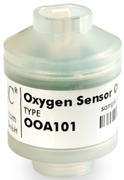
Oxygen Sensor: OOA101