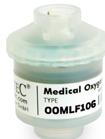
Oxygen Sensor: OOMLF106

The EnviteC sensor family is part of the extensive line of Honeywell gas sensors. To learn more about the product, or the many other gas sensors in this series, click here .